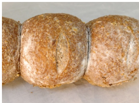
WPA-142 Wheat Pull-apart Roll 240/1.5 oz. FB

Our Original home style roll made with care, hand scored and flour dusted. Extremely versatile as table bread or sliders. A real winner!