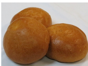
SLD-108 Slider Brioche Whole 160/1.25 oz. FB

These little square delights bring a unique, eye-catching presentation and variety to your table. These mini-Ciabatta's are crusty on the outside and moist on the inside. Try as a slider.