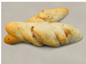
GBS-810 Garlic Breadstick 180/2 oz. PB

This traditional breadstick is hand scored and adds a twist to any bread basket. Use for soups, salads and children's menus.