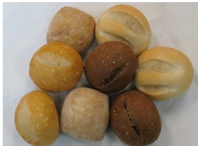
FAS-129 Assorted Dinner Roll 252/1.3 oz. PB

A true classic, made from a long fermented dough resulting in a thin crust and moist interior. A roll your guests are sure to remember.