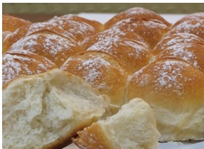
JSH-240 Traditional Pull-apart Roll 240/1.5 oz. FB BPP-743 Banquet Pull-apart Roll 384/1 oz. FB

For more information and samples call 781-598-4451