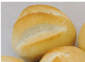
FDR-100 French Dinner Roll 180/1.3 oz. PB

Packaged: 72-ea / French, Wheat and Onion Dill. 36 Sourdough This assortment is a favorite for it satisfies everyone's taste buds and has such a multitude of uses.