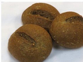
DWR-145 Wheat Dinner Roll 180/1.3 oz. FB

Our French dinner roll with a crispy crust and a delicate interior, is a tasty addition to your meal. Perfect in a bread-basket.