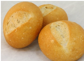
TFR-115 Traditional Dinner Roll PB BTR-842 Baked version New Item Both 180/1.3 oz.

Our true brioche recipe in a pull-apart with the added aroma and flavors of onion and poppy seed.