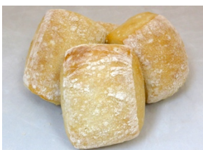
CAR-180 Ciabatta Dinner Rolls 210/1.4 oz. FB New Pack

Prepared with fresh roasted garlic, blended with extra virgin olive oil and topped on our hand scored breadstick, will surely entice and delight your customers. A great compliment for soups and pastas!