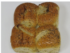
OPB-792 Onion and Poppy Seed Pull-apart Roll 240/1.5 oz. FB

This new variation combines a butter and egg dough into a unique and appealing roll suitable for table bread or sliders.