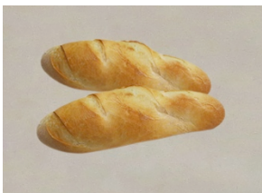
FBS-800 French Breadstick 180/1.3 oz. PB

For more information and samples call 781-598-4451